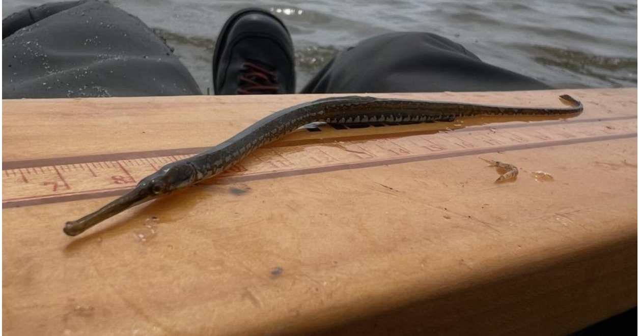
Figure 3. Bay pipefish captured in the Salinas River Lagoon while beach seining for tidewater goby on May 27, 2025 (near the slidegate).