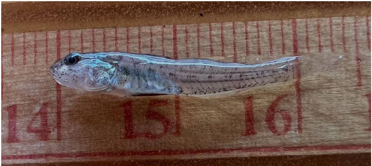
Figure 4. Juvenile yellowfin goby captured in the Salinas River Lagoon while beach seining for tidewater goby on May 27, 2025.